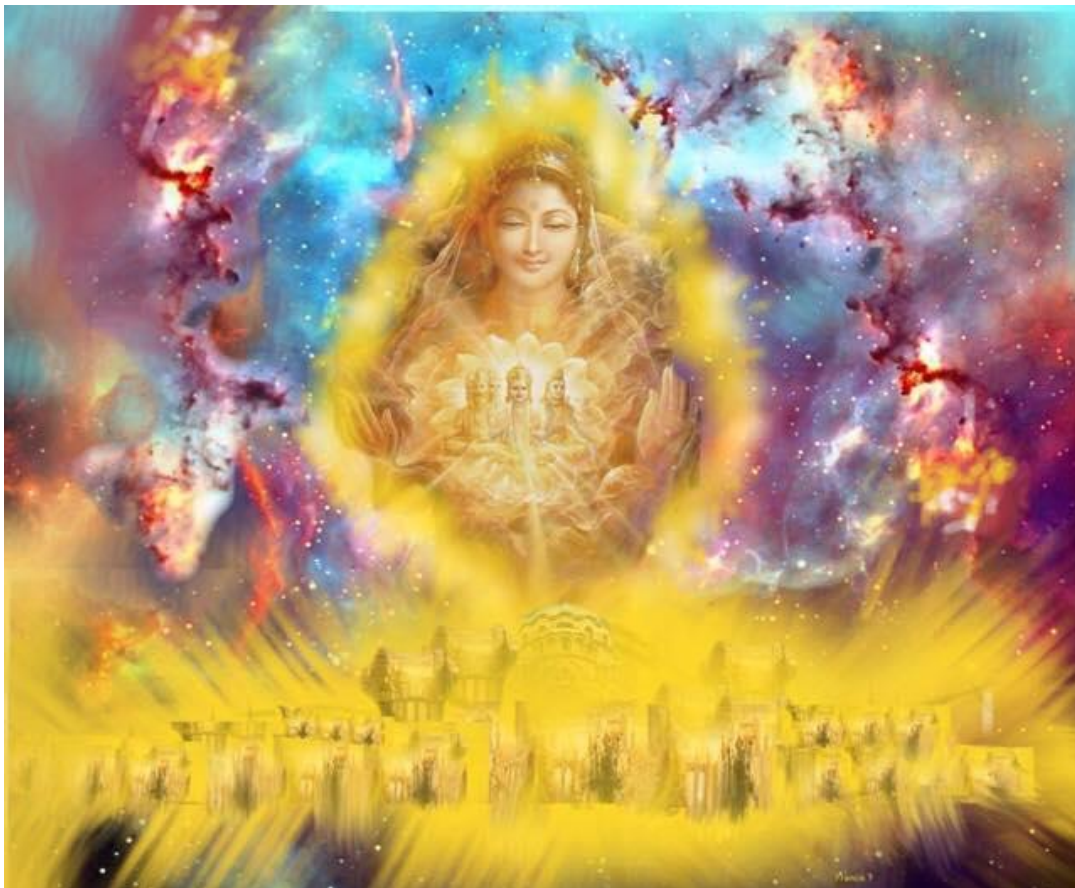
Fig. 2. An artist's view on the "Second Coming." This interdimensional being will supposedly appear as the Savior regardless of which religion a person is believing in. He will be able to connect them all and create a One World Religion. ( Illustration by Frank Tobin ).

There were times in the past when the Orion Empire participated in wars and even instigated them, but they have learned and don't do that anymore. The main military activity is to defend the remote borders of the Empire—not to expand it by force. This is why it's hard to get rid of the rebels. If their leaders get caught, they will be put on trial, and believe it or not—humanity will have a say in the verdict! Are they to be annihilated or put in electronic prisons for the rest of eternity? Will we show mercy and pardon those who are willing to change? All these choices are something to consider already now because according to my sources, there is a chance that this can happen soon—it all depends. I would imagine that even humans who escape the trap might be summoned in the future to participate and be witnesses in such a trial.