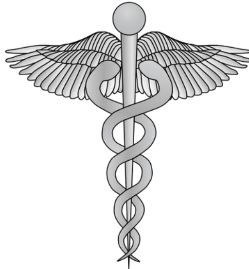
Fig. 1. Double Helix DNA, or the “Medical Caduceus.”

Thus, we humans are the ones who are creating our common reality as long as we're in our bodies, and we perceive our existence through our programmed 2 strand DNA. What we are supposed to see is already pre-determined by the creator gods who created Homo sapiens sapiens—they fused parts of the DNA together to get certain effects, and they added their own DNA to the mix to have their own beingness included in the 3-D “reality.”