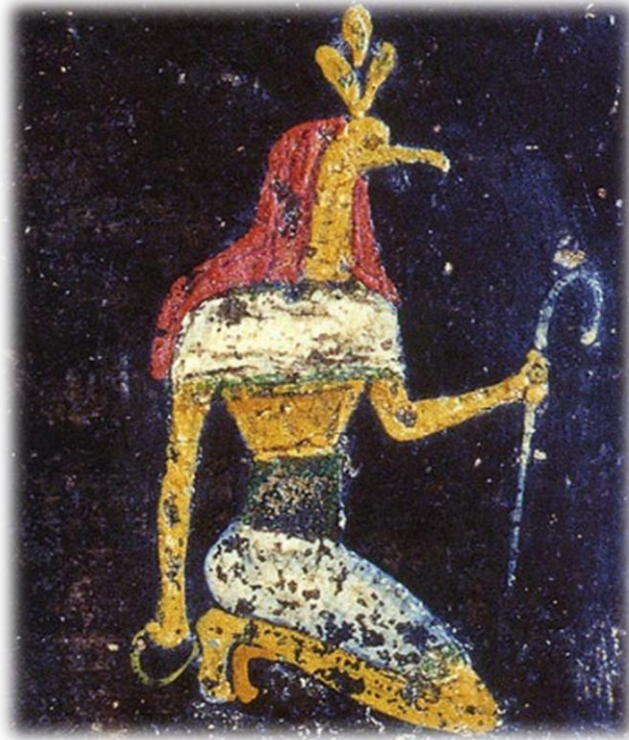
Fig. 1. Thoth, depicted as an ibis bird. Again, here we have the Bird Tribe .

The Greek and Egyptian explanation to what happens in the afterlife is that we are going on a journey through the astral dimensions of the Underworld, located under the Earth's surface. This is also the reason why Pharaohs often were put in their sarcophaguses together with their most beloved belongings—sometimes also with their pets, such as cats and dogs (which are very psychic animals, by the way, and worked as psychic influences in the Royal Courts)—they wanted all this to be brought with them to the Underworld. They even took their faithful servants with them to the afterlife—people who had worshipped them (more human sacrifice). All this was considered assisting the Pharaoh in his afterlife, in which he expected to become like the gods: granted eternal life.