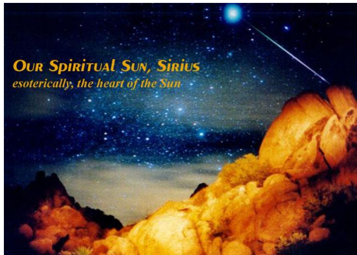
Fig. 3. Sirius feeding our sun with its energy via one of more portals.

This hypothesis is quite interesting but at the same time concerning because if our sun is dependent upon Sirius for its warmth and emission of energy, doesn't this make the AIF more in charge of our potential development as a species? We know that Sirius has a big role in the ancient stories about the AIF, and some of these beings are from there. If they are as technologically advanced as we have reasons to believe, can they also control this electrical current going from Sirius to the Sun? Can they "turn the knob" up and down, in a manner of speaking, to either increase or decrease the energy, thus creating "cycles" in the development of mankind? It's a mind-boggling thought but quite plausible, taking into consideration that our own technology is on a Stone Age level.