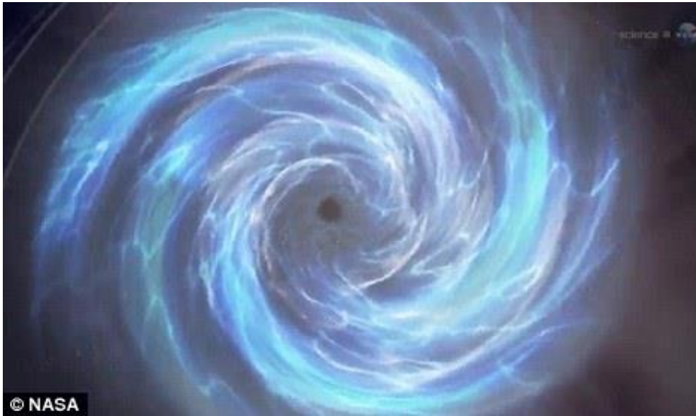
Fig. 2. A portal between the Earth and the Sun.

Another interesting thing is that NASA just recently (in 2012) discovered portals between the Sun and the Earth! These portals often start around 10,000 miles up through the Earth's atmosphere, and continue, uninterrupted, until they reach the Sun's atmosphere. 2 Most of these portals are very small and open and close in a matter of seconds, while others are wide open and fairly stable.