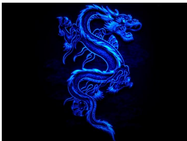
Figure 2. "The Blue Master Dragon", here moving through the VOID in a sinusoidal waveform.

The Thubans distinguish between the Sky Blue or Cyan colored Dragon and the Red Dragon. The former is the Master Dragon and the latter is in prophecy called the "Devil", and is so neutralized (discharged) in the Entwined Serpent or Double-Dragon of the White Lucifer with the Black Lucifer. But as long as we are reading this paper, we need to keep in mind who this group of entities, declaring themselves as being next under the Prime Creator, are. They say they are both our ancestors and our descendent, like so many others. The thing is that if we look at this in perspective, there is a chance that each of these channeled sources who say they are us in the past and in the future could potentially tell us the truth. We have the Grays, we have the Pleiadians, the Cassiopaeans, and many more...They all fit into this agenda, as we shall see.