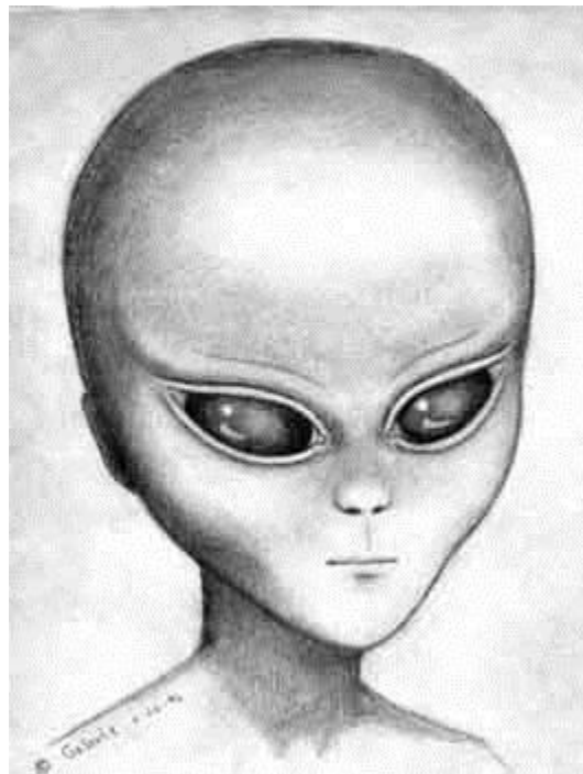
Figure 4. Artist's impression of Essassani Gray

So, the abductions by the Grays are not present time abductions so much as they are abductions by our future selves on our present time versions of themselves! And sometimes, say Lyssa's sources, they have help from more humanoid races, who are present during the abductions, to make the abductee feel safer, because they recognize the familiarity in the humanoid presence.