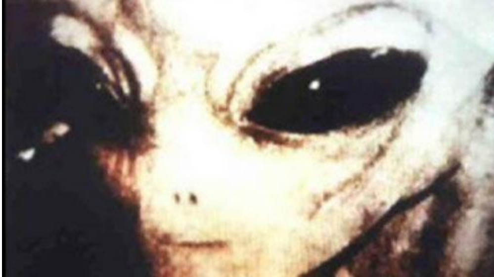
Figure 5. A close-up of a "Zeta" Gray, as we are used to seeing them.

The Grays, of course, are the product of the Machine Kingdom, where the human race slowly and successively turns into half machines and half humans, with no emotions and no means to reproduce; a dying race. A lot of things, as we shall see soon, will happen on these Machine Kingdom timelines before we get to the Essassani stage. But the eerie question is; what will happen after the Essassani society? Why does it stop there, where humanity are better off than in earlier stages where the Grays are visiting, but still quite emotionless and not able to have sex? Not a word is said about what will happen after Essassani...!