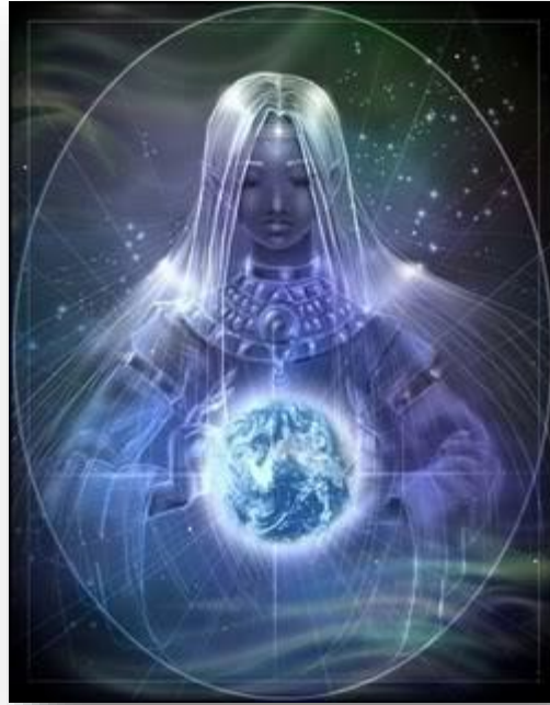
Figure 3. A so-called "Indigo child", having special talents and psychic abilities.

The second problem is that when we are announcing that so and so parent has an Indigo child, the government knows where they are and are often quick at targeting these kids. They want them to experiment on, now and in the future. Again, the Sirians don't understand higher consciousness in the form the Namlú'u of old had it; they don't understand Homo sapiens, and they certainly will not understand Homo Nova. There will be a turning point when the Alliance no longer will harass those of higher consciousness, and leave us alone, simply because we understand the rules now and can say "no" to further manipulation, abductions, and experiments. Homo sapiens can't, because they are too deep into it at this point and the majority of them seem to be beyond salvation, unfortunately.