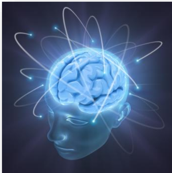
Figure 1. Neuro-pathways.

But not only that. We must also break the chains from our future; the future timelines, such as those of the Machine Kingdom, which we don't want to participate in, but perhaps we will -- on a timeline or two. Therefore, we must also confront the future and merge these timelines as well. My efforts are an attempt to make this happen. However, I'm not the only source to make this happen, and it's also part of a natural phenomenon which has to do with our alignment with the Galactic Centers.