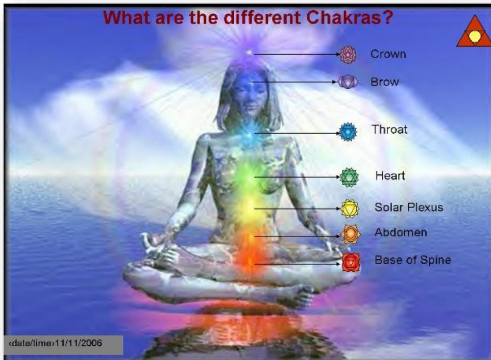
Figure 2. The seven body chakras. The 4th chakra is green and called the "Heart chakra".