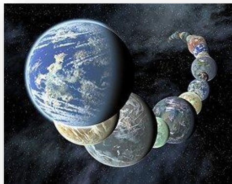
Figure 6. The number of Earths are almost infinite. Although some of us will perceive ourselves as living on the same planet, we are actually all living on our own version of it.