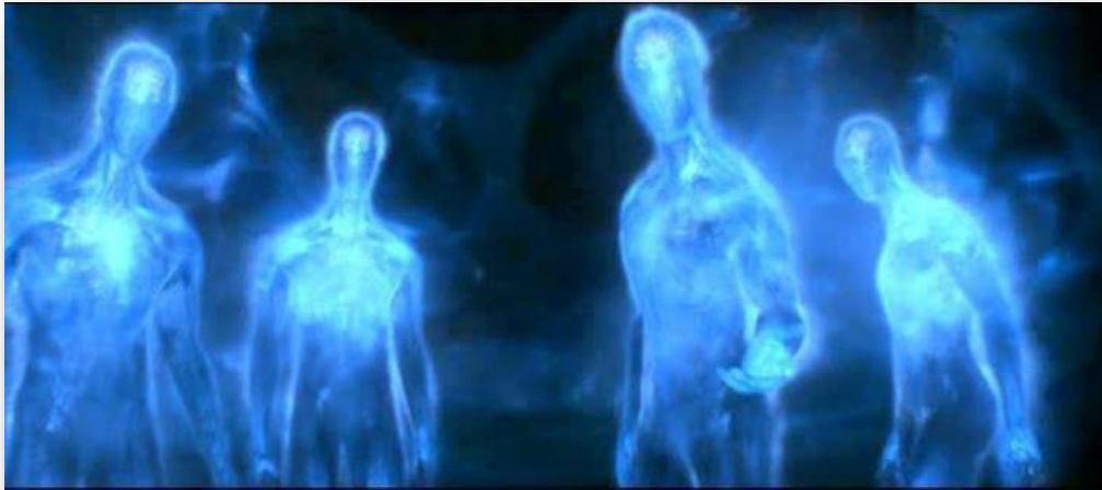
Figure 5. The Sirians will no longer be able to seduce us and manipulate us into entering their time/space astral prison.

This does not guarantee total freedom from amnesia in the next incarnation, unfortunately. At least not for everybody, albeit I'm sure for some. Still, more memories and a lot better intuition would help the incarnated person to continue their mission in the right direction. After all, evolution does not go backwards, and once you've achieved a certain vibration and level of awareness and consciousness, you won't lose it in the next lifetime.